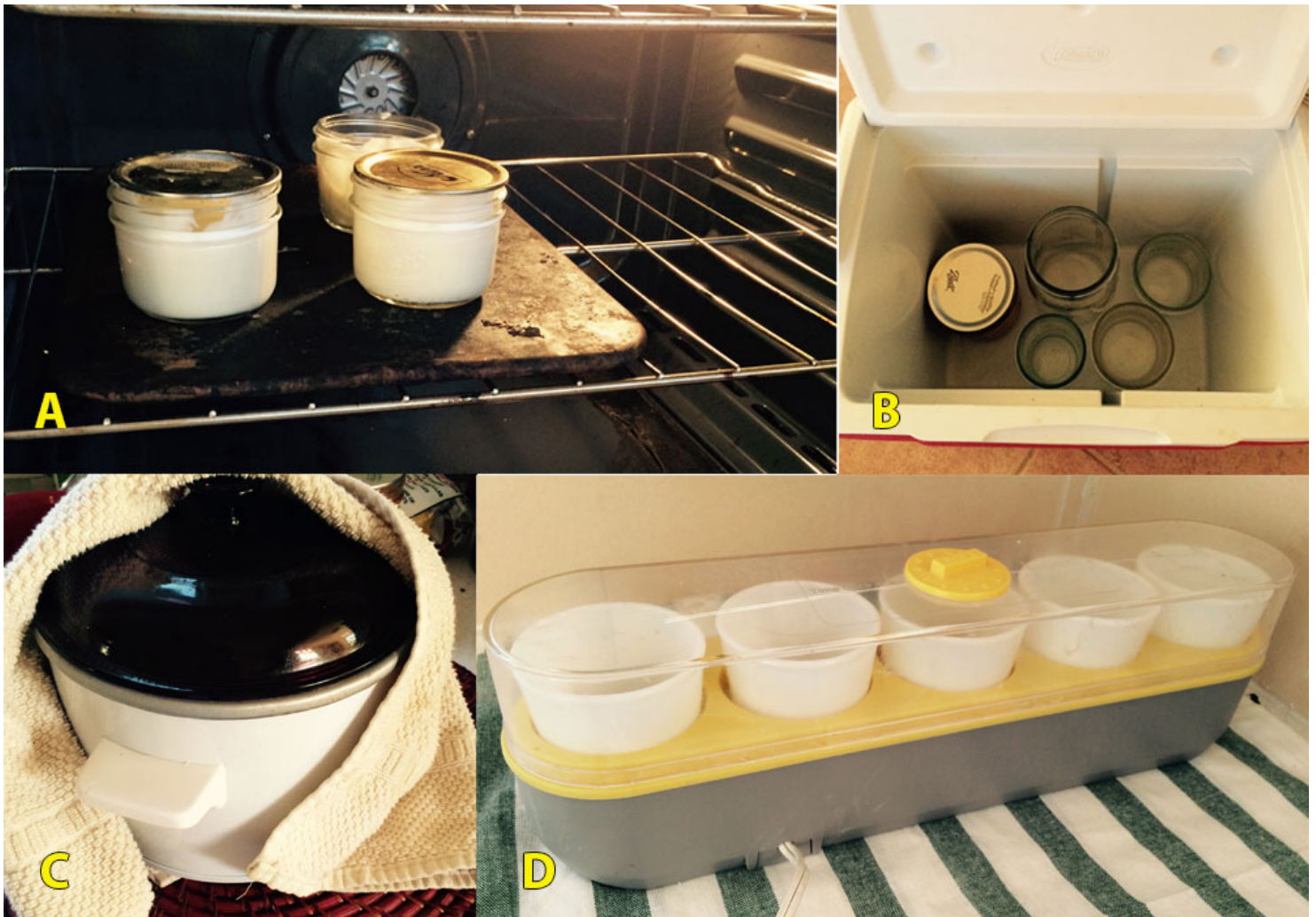
Figure 3. Yogurt incubation methods: A) Oven method. B) Insulated cooler. C) Crockpot. D) Commercial yogurt machine.

3. In a crockpot. The crockpot can be used to heat the milk, allowed to cool then add yogurt starter for fermentation. Wrap the crockpot in a towel and allow to set in a warm area.