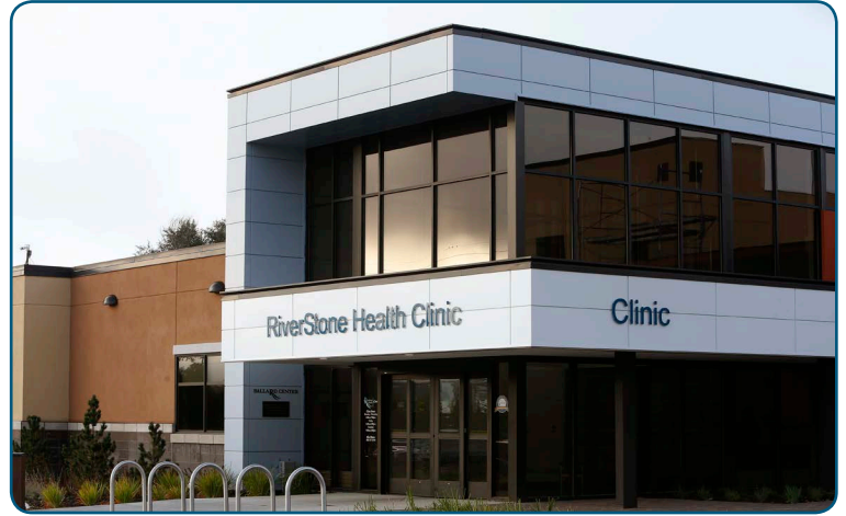
RiverStone Health Clinic opened its doors to the community January 2018.

The new RiverStone Health Clinic boasts 48 exam rooms in 32,000 square feet; our former space contained 31 exam rooms in 17,000 square feet. Designed with capacity and patient growth in mind, the Clinic will serve our community neighbors well into the next two decades. Commemorative giving opportunities remain available within RiverStone Health Clinic. Exam rooms, and areas dedicated to behavioral health and residency education, are offered to those who wish to take their place in RiverStone Health's history.